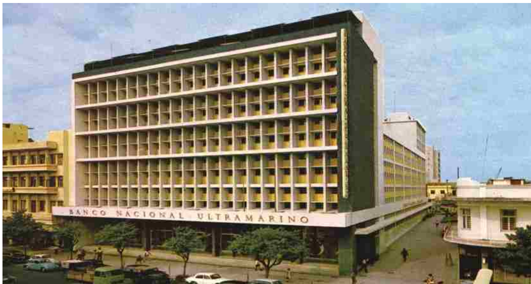
Image of Banco Nacional Ultramarino.