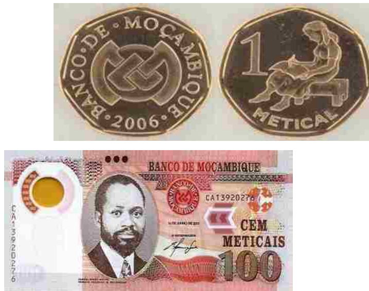
Specimen of coins and notes of new metical

This law also decreed that the Central Bank of Mozambique was the only institution that was authorised to issue the metical and to determine the currency's exchange rate. It was also authorised to intervene in monetary and foreign exchange markets. The central bank was mandated to determine the value, quality and quantity of the notes and coins, the inventory model and the mechanics of conversion. In addition to the previous law, Law no. 3/80 was approved in terms of which, from June 16, all old banknotes in circulation no longer had any value. These included the notes issued by the previous colonial administration and the notes that bore overprint " Banco de Moçambique ". 344