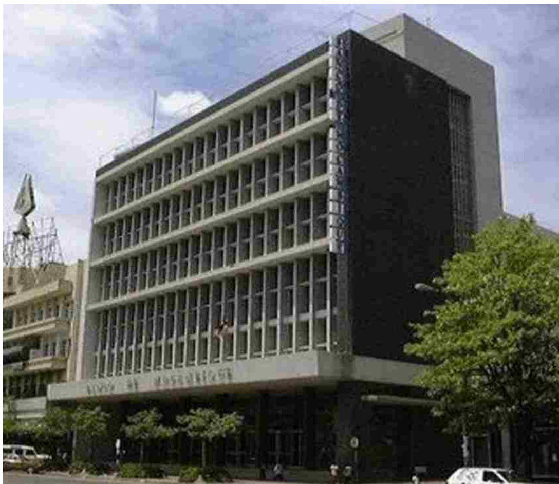
Image of Banco de Moçambique.