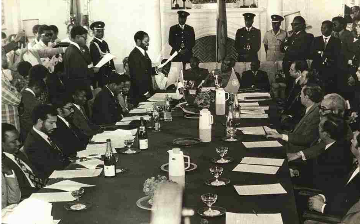
Lusaka accord signing session.

The economic situation in the transition period (1973-1975) was characterised by the collapse of production and marketing because of the mass exodus of settler communities returning to Portugal while other people left to resettle in South Africa or Rhodesia. Particularly the loss of skilled people led to a serious disruption of the economy which also affected the financial system. There was a widespread crisis in production and supply, with especially the rural areas being hard hit. In addition, there were successive natural disasters such as cyclones, floods and droughts, which also impacted adversely on the economy. 183